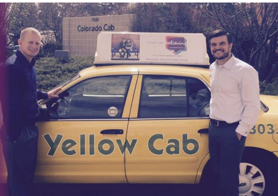
Yellow cab displays

Use creative marketing to reach thousands: In Denver, the campaign message was prominently displayed on three billboards throughout the city, as well as 50 bus shelter advertisements, and 20 Yellow Cab displays. An additional 2,000 Yellow Cabs had bumper stickers proclaiming the Start by Believing message.