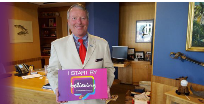
Orlando Mayor Buddy Dyer

Here are a few of our personal favorites: