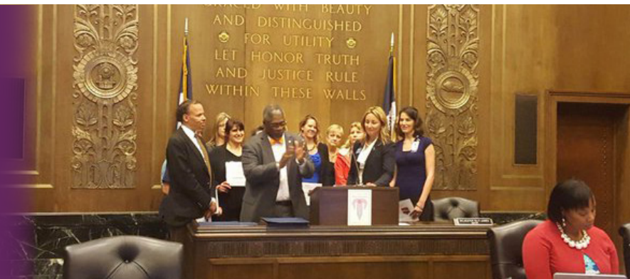
Kansas City, Missouri Proclamation Ceremony