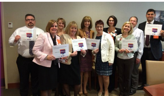
Elmhurst, Illinois Hospital Administrators

Use social media to announce support of Start by Believing by sending out a tweet or post with the commitment placard. We've said it before, and it's worth saying again – use social media!